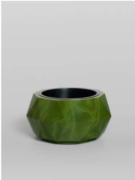
03 Anna Dickinson Vessel , 2014 Moulded, ground and polished glass, oxidised copper H. 13 cm x W. 26.5 cm Private collection