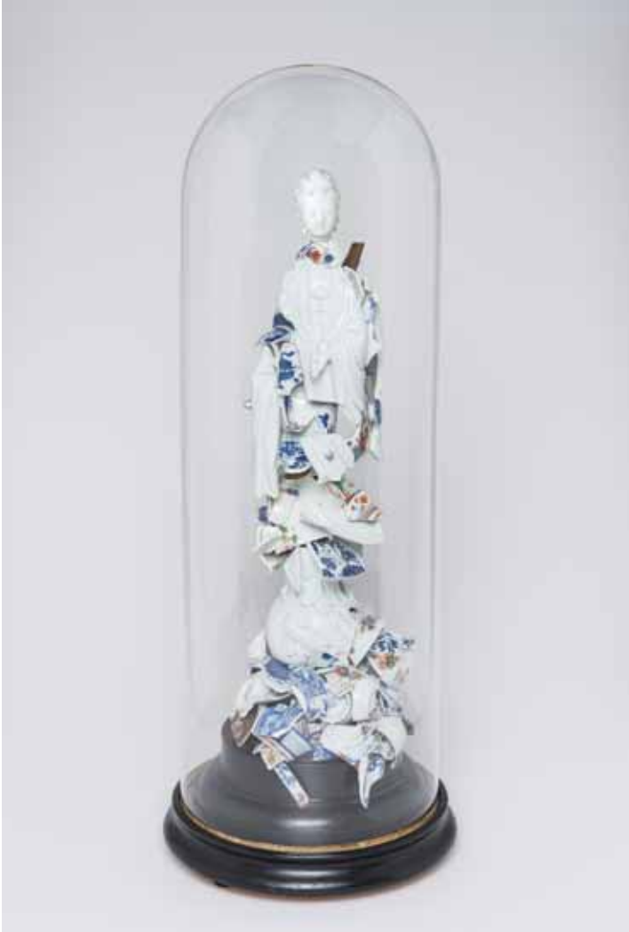
Bouke de Vries (Netherlands, 1960) Fragmented Guanyin , 2014 Ancient porcelain fragments assembled, bell jar H. 75 cm Purchase, 2015 – Inv. AR 2015-055 Collection of the Musée Ariana, Geneva

In the absence of an acquisitions budget, the Musée Ariana succeeds in developing its collections in various ways, particularly with the aid of special funds that allow it to make direct, free and informed choices. More specifically, a purchase can actually fill a gap in a series while at the same time facilitating the verification of the object's own provenance and documentation. Purchasing is generally, therefore, the most appropriate method of acquisition. It is not uncommon to buy an item directly from artists, after a temporary exhibition at the museum, in order to keep a tangible reminder of it; or better still, the ceramists themselves choose to donate one of their pieces to the institution, as a token of their