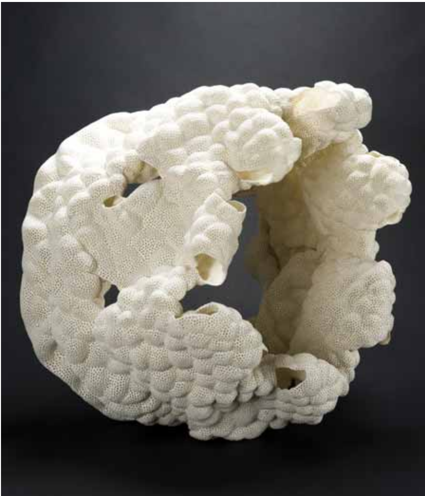
Zsuzsa Fűzesi Heierli (Hungary, 1953) Double 4 , 2015 Perforated modeled porcelain biscuit H. 46 cm Purchase, 2015 – Inv. AR 2015-057 Collection of the Musée Ariana, Geneva

chain mail structure produces stoneware pieces of astonishing and unparalleled flexibility: Kimono Vase (2008) changes shape, in fact, when handled. Talking about her pieces, the ceramist uses terms with woven textile connotations. In practice, she does indeed interweave her ceramic rings to form a mesh through successive firings.